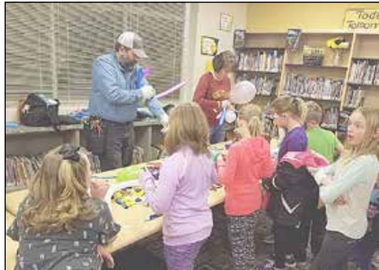
The Fairbank PTO sponsored Family Fun Night on Friday, March 9. Students and families participated in the cookie walk, face painting, balloon-making, hula hoop contest and dancing. The PTOs fund lots of items and opportunities that enhance our learning environment at Wapsie Valley.