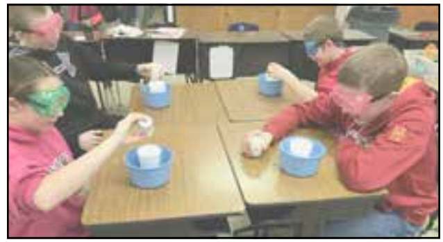
7th and 8th graders explore chemical reactions.