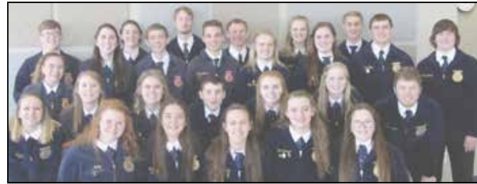
Wapsie Valley FFA members participated in Leadership Development Events at the 2018 SW Sub-district competition at Hawkeye Community College in Waterloo.