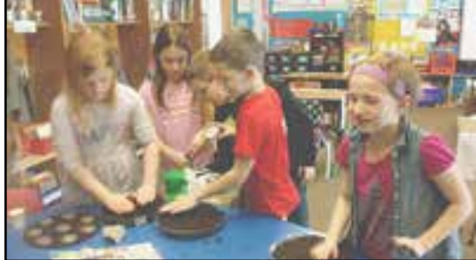
Kindergarten, 1st & 2nd grade planted a taco!! Yum!