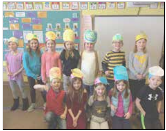
First and second graders perform a readers' theater about planets!