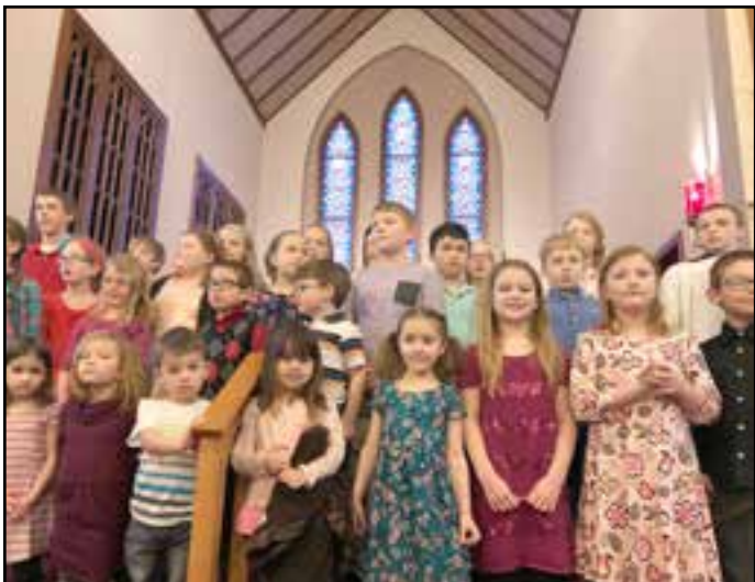
Sunday, March 18 the CLS students sang "I Am Jesus Little Lamb" at Immanuel Lutheran, Klinger.