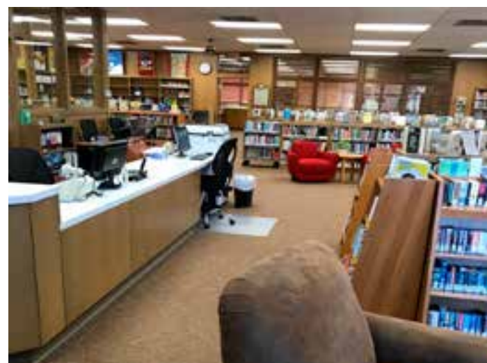
Current library interior