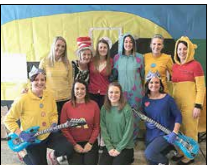
Students and parents participated in Literacy Week's activities at Camp Wapsie...Read S'More! Thanks to our staff, WVEF, Readlyn & Fairbank PTO, Readlyn Savings Bank, and Northeast Security Bank for their donations and support to make another successful Literacy Week!