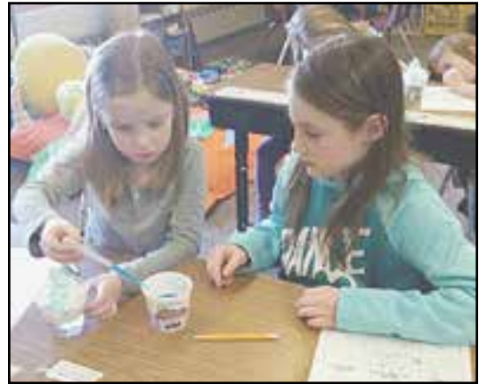
Water cycle experiments with 1st and 2nd graders.