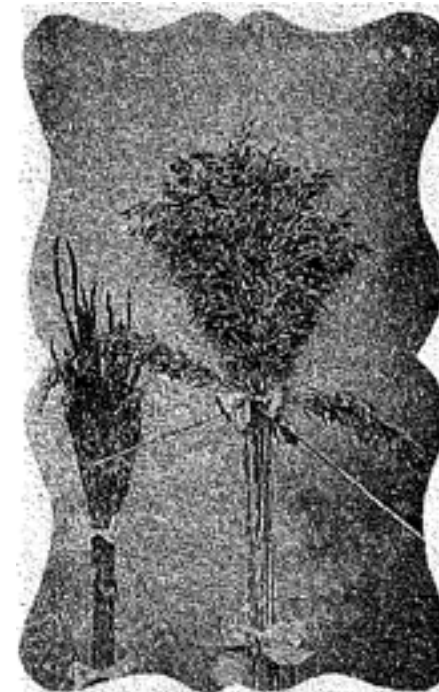
Schumacher Oats - In 1917 produced on an average 102 bushels per acre. In 1918 produced an average yield of 97.5 bushels per acre.