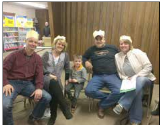
On Thursday, March 15 the CLS families came together for a delicious soup supper at Family Game Night before the midweek Lent Service at St. Paul's.