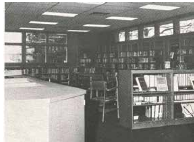
Interior of Readlyn's brand new library 1968

To keep up with the changing times, the Readlyn Community Library has evolved in many ways. Today's libraries are multi-faceted – many things to many people. Libraries are a resource providing assistance, knowledge, entertainment and a sense of community. The library will always hold an important role in the community of Readlyn and the surrounding area. Visit our website: www.readlyn.lib.ia.us