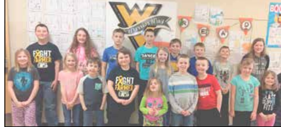
The winners for the February Warrior Way All-Stars are shown for displaying the Warrior Way every day!!