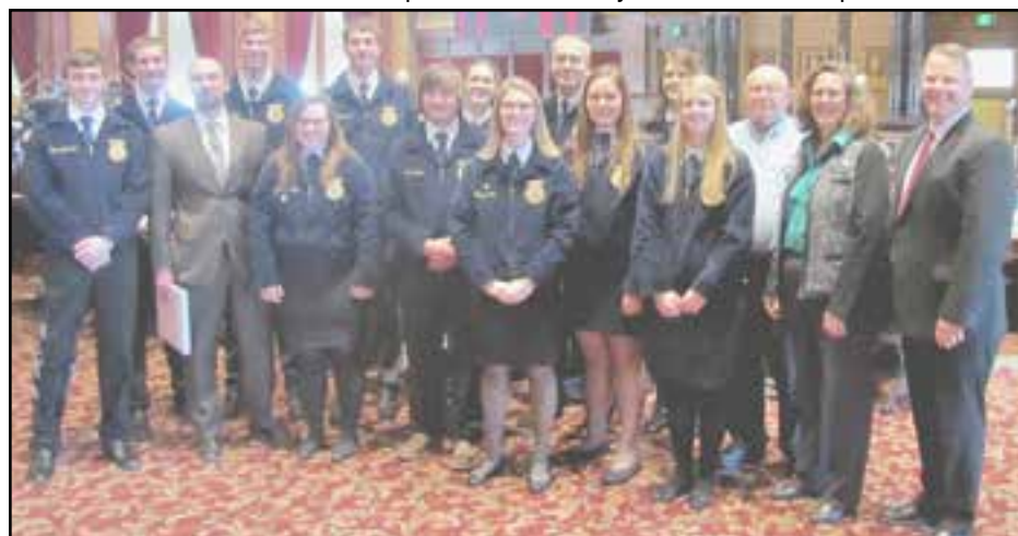
FFA members pictured with the House of Representatives.

Learn more about the history of Readlyn with every issue of