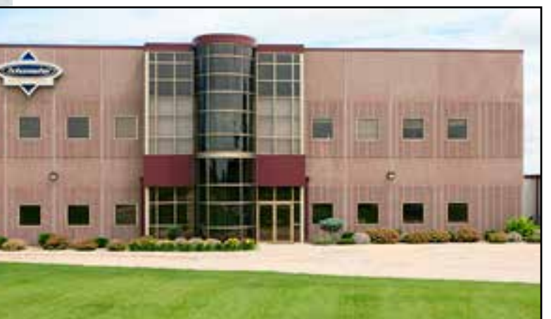
Schumacher's Machine Shop is the original building in Denver, Iowa. Shown above is Schumacher Elevator Company today.