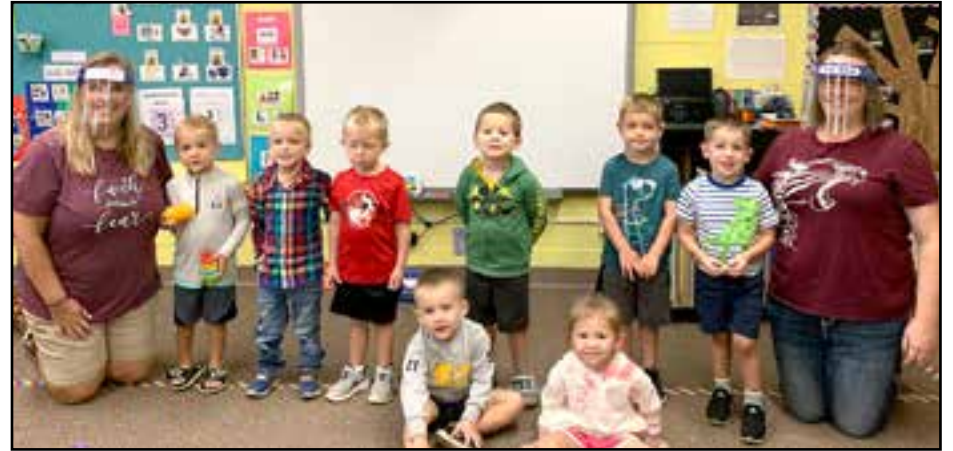
3-year-old preschool (T TH)