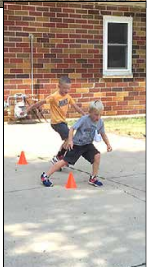
2nd grade students are practicing math skills.