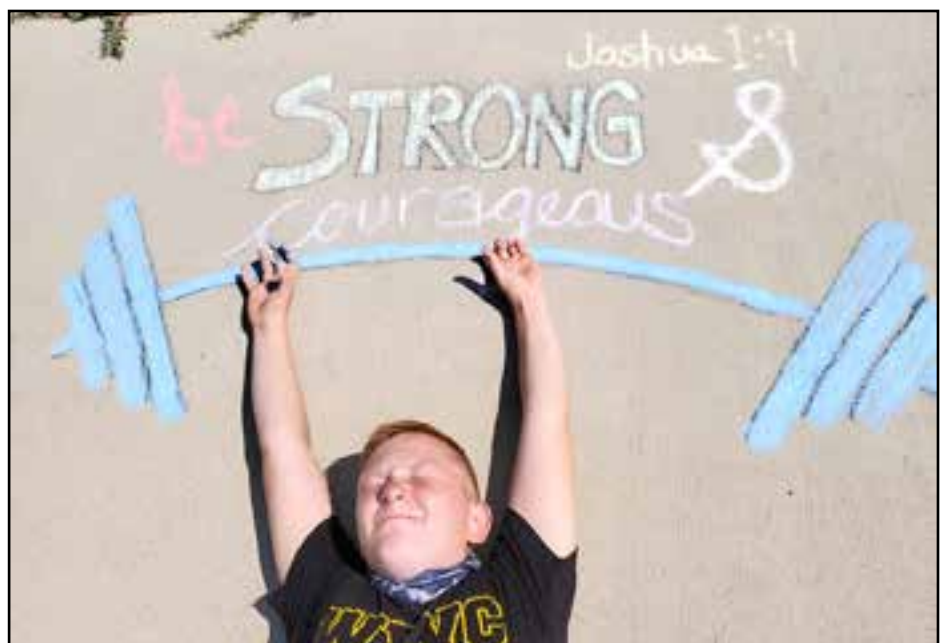
Wildcat Wednesday fun in Art class! We are strong and courageous with God our Father at CLS!