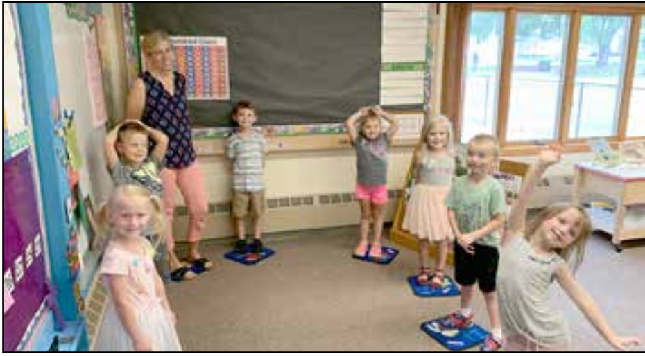
Community Lutheran School is excited to be back in the classrooms with students for the 2020-2021 school year! This year first and second grade moved out to our Klinger campus to join third through sixth grade classrooms. Preschool and kindergarten remain at our Readlyn campus. Kindergarten is shown above. Yesterday, today and always we are trusting in the Lord!