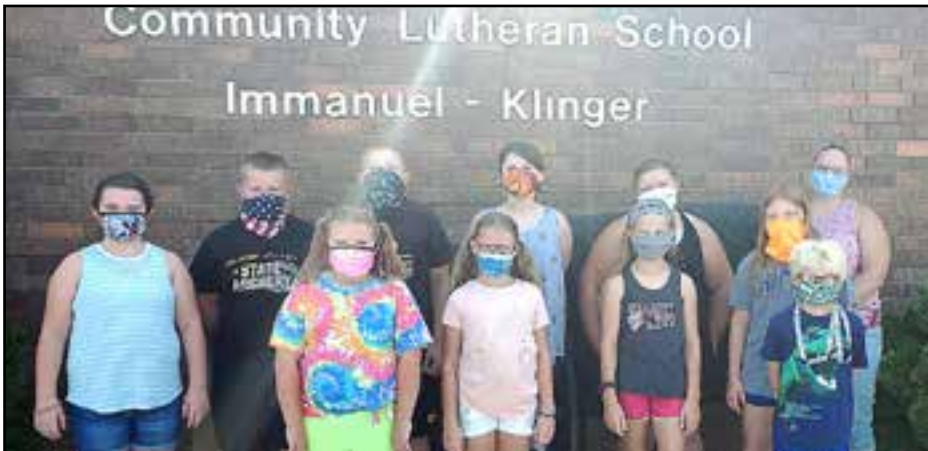
3rd - 6th grade