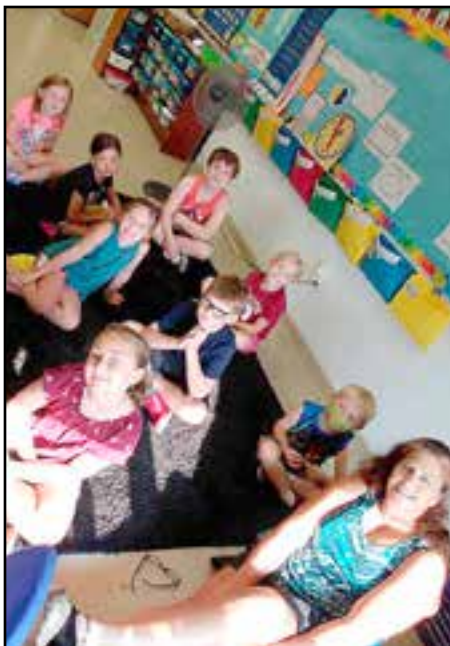
1st and 2nd grade