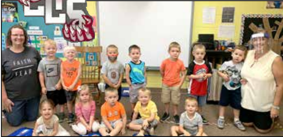
3-year-old preschool (M W F)