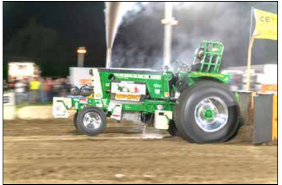
Brian Buchholz - Bad Kitty- 4.1 Limited Pro Stock