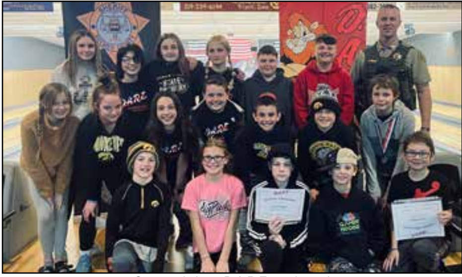
Congratulations, D.A.R.E. graduates!