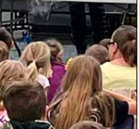
Students enjoyed the Grout Museum assembly.