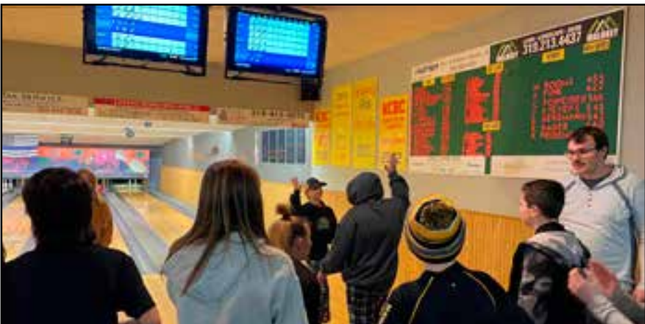
Students celebrated their D.A.R.E. graduation with bowling.