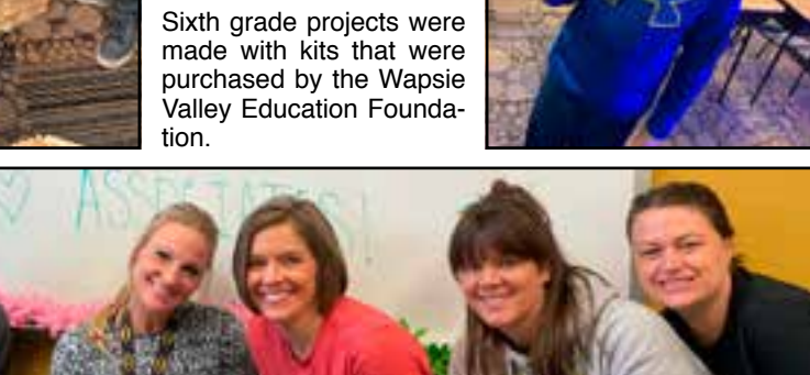
We are grateful for our wonderful associates!