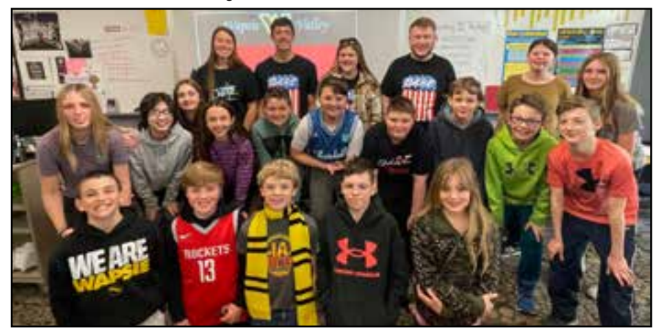
D.A.R.E. high school mentors met with the 6th grade class.