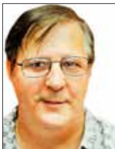
By J.D. Francis

You have to wonder, who comes up with these sorted alternate uses for different products, and who tests them for the end results? A can of Coca-Cola cleans battery cables, Windex kills wasps and bugs, or, one I can relate to, a can of beer will loosen rusty bolts and clean gold jewelry. (Now there's a 6-pack I need to invest in; rusty bolts will have to take a back seat.) Vicks VapoRub, if regularly applied, will remove stretch marks.